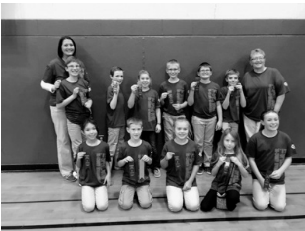
4th Grade Team