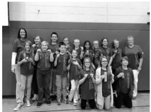
5th Grade Team